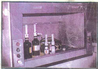
WITH REMOTE CONTROL VALVES