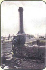
CENTRIFUGAL FAN (DIRECTLY COUPLED)